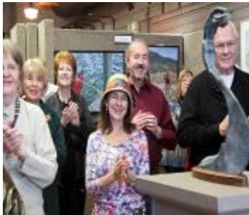
Applauding the judge's decision!