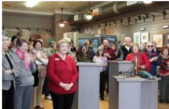
Artist of the Year show attendees waiting for announcement of Artist of the Year